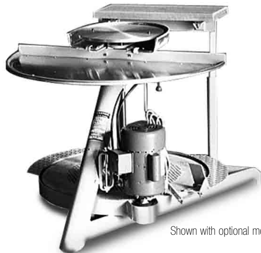
Shown with optional motor

This kit only fits Lockerbie wheels with serial numbers following No. 2894 (same as motor described above.)