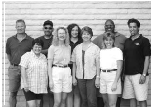
Marjon Ceramics Distributors in Phoenix and Tucson

Laguna Distributors are professional ceramic suppliers. They stock Laguna products and offer service and product support before, during and after the sale. A growing number of companies have adopted a philosophy of "selling cheap" on the Internet and then abandoning customers after the sale; not Laguna Distributors. Located throughout much of North America and many countries worldwide, Laguna Distributors purchase up to 48,000 pounds at a time allowing them to pass product and freight savings along to you. For assistance in locating your local Laguna Distributor, visit www.lagunaclay.com or contact distributors@lagunaclay.com .