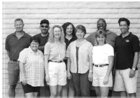
Marjon Ceramics Distributors in Phoenix and Tucson

Laguna Distributors are professional ceramic suppliers. They stock Laguna products and offer service and product support before, during and after the sale. A growing number of companies have adopted a philosophy of "selling cheap" on the Internet and then abandoning customers after the sale; not Laguna Distributors. Located throughout much of North America and many countries worldwide, Laguna Distributors purchase up to 48,000 pounds at a time allowing them to pass product and freight savings along to you. For assistance in locating your local Laguna Distributor, visit www.lagunaclay.com or contact distributors@lagunaclay.com .