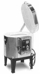
120v Doll or Test Kiln